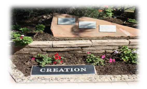
Genesis 2:15 "The Lord God took the man and put him in the Garden of Eden to work and take care of it."

MOSES WAY continues the story of Genesis through Deuteronomy. It includes the Original Sin, exile from the Garden of Eden, the Exodus from Egypt and the giving of the Ten Commandments.